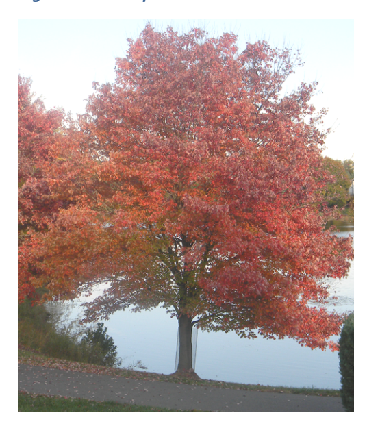
Figure 5 Red Maple