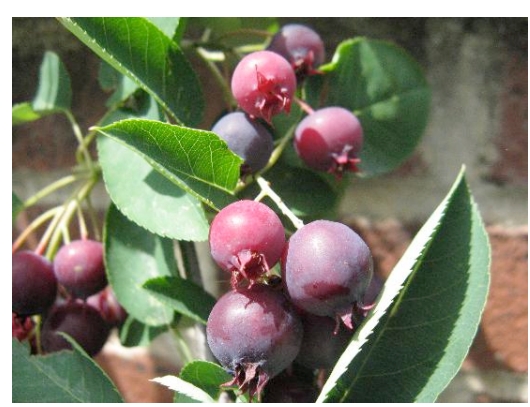
Figure 3 Serviceberry