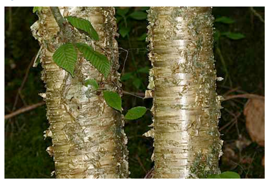
Figure 2 Yellow Birch Bark

1) Wild Raisin (withe rod) – a common shrub that can grow up to 12ft tall and has pretty umbrella-shaped clusters of white flowers