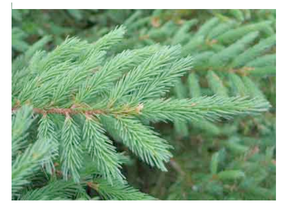
Figure 1 Black Spruce