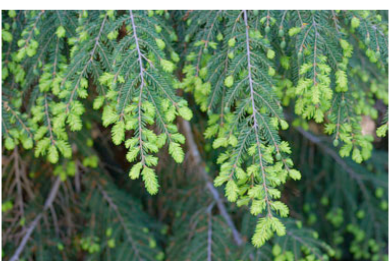
Figure 4 Eastern Hemlock